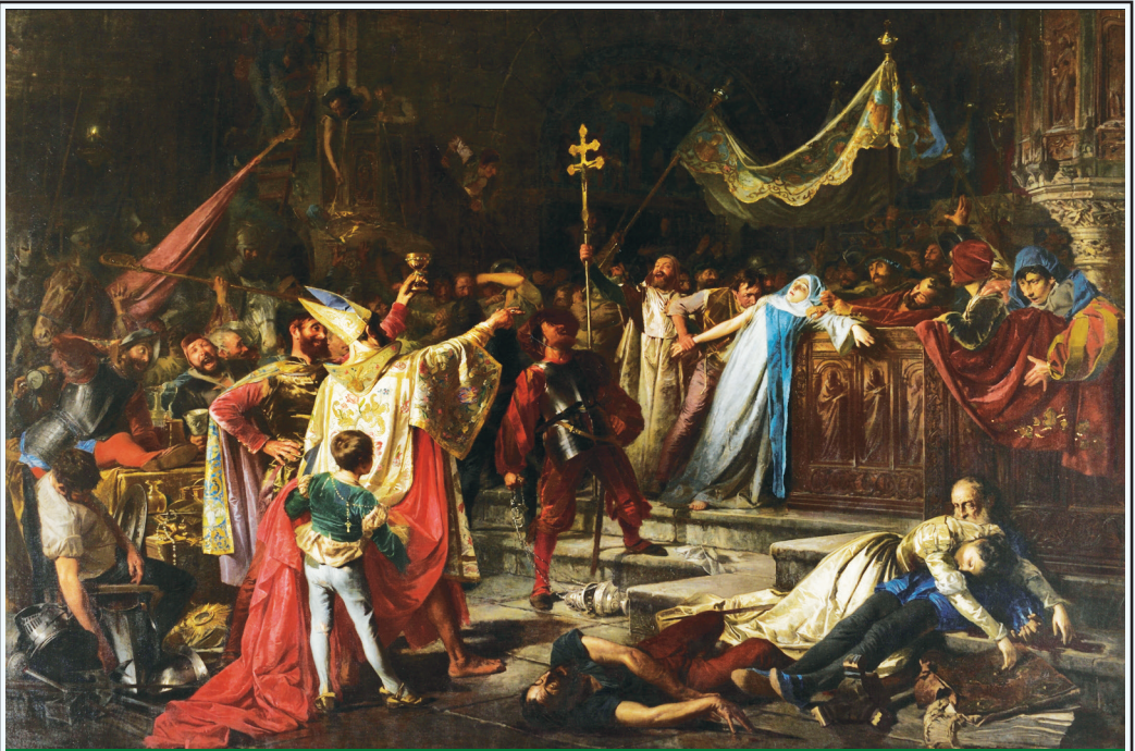
The Sack Of Rome - Francisco Javier Amérigo y Aparici (1842 - 1912)

a Satanic fury let loose by God's permission on a city that had been guilty of so many crimes. The Medici Pope, Clement VII, barely escaped with his life, taking refuge in the fortified and impregnable Castel Sant'Angelo, paying the price for all the scandals of Renaissance popes before him. It would be months before the pope could negotiate terms with the army leaders; finally the city was freed from the drunken slaughter and pillage, but by that time, Rome, the eternal city, the marvel of the whole world, was but a shadow of its former self. The population was decimated, corpses rotted in the streets, houses burnt to the ground."