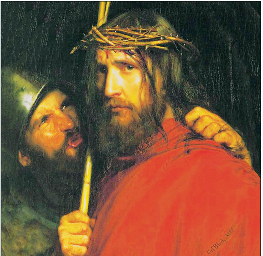
The Mocking of Christ - Carl Heinrich Bloch (1834 - 1890)