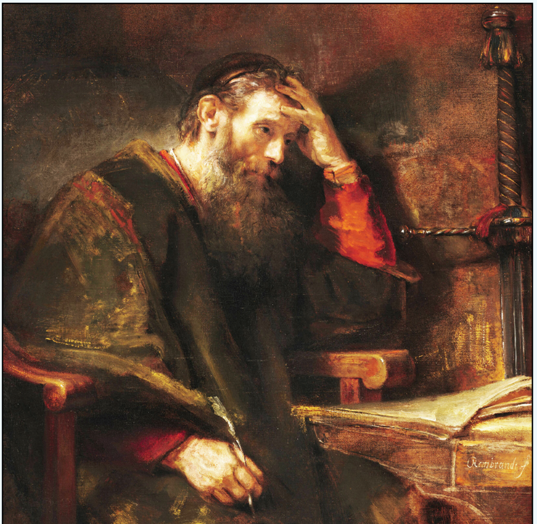
Saint Paul by Rembrandt (1606 - 1669)