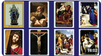
Devotion - Meditations on the Seven Sorrows of Our Lady

I would like to extend a heartfelt “thank you” to all of you who have supported me since I launched Legio Sanctae Familiae back in July of 2022. The Holy Sacrifice of the Mass is offered monthly for your intentions. I firmly believe that the only way that we will regenerate our country is through the building up of strong Catholic families who will in turn form strong Catholic communities that will change the direction our society is headed. I believe this because it is God’s plan for mankind as revealed in Sacred Scripture and the Traditions and Teachings of the Catholic Church. Marriage was instituted by God for the building up of His Kingdom, for raising Saints for Heaven. May we never tire of promoting Holy marriages and Holy religious vocations to our young people so that they will come to know their purpose in life and find eternal happiness in Heaven.