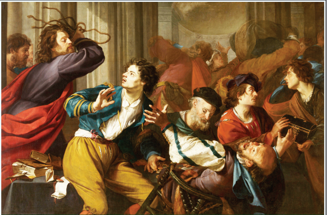
Jesus Cleanses the Temple - Theodoor Rombouts (1597 - 1637 )

You can see this mentality in the way that many Catholic funeral services are conducted today. The deceased is lauded and we are told that they went straight to heaven. The primary purpose of the Holy Sacrifice of the Mass is forgotten at these funeral services and the greatest comfort for those who are bereaved, that Jesus Christ died on the Cross to save us from our sins, is hardly mentioned.